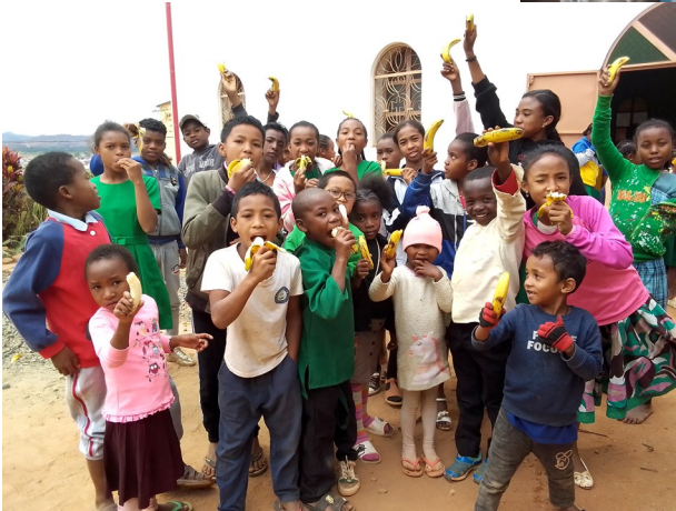
THE FEEDING OF SUNDAY SCHOOL IN AMBATONDRAZAKA ON THE MEETING OF CHILDREN AND TEACHERS OF SUNDAY SCHOOL IN THE DEANERY OF AMBATONDRAZAKA ON 12-13-14 JULY